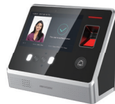
DS-K1T605MF-B (Backup battery)